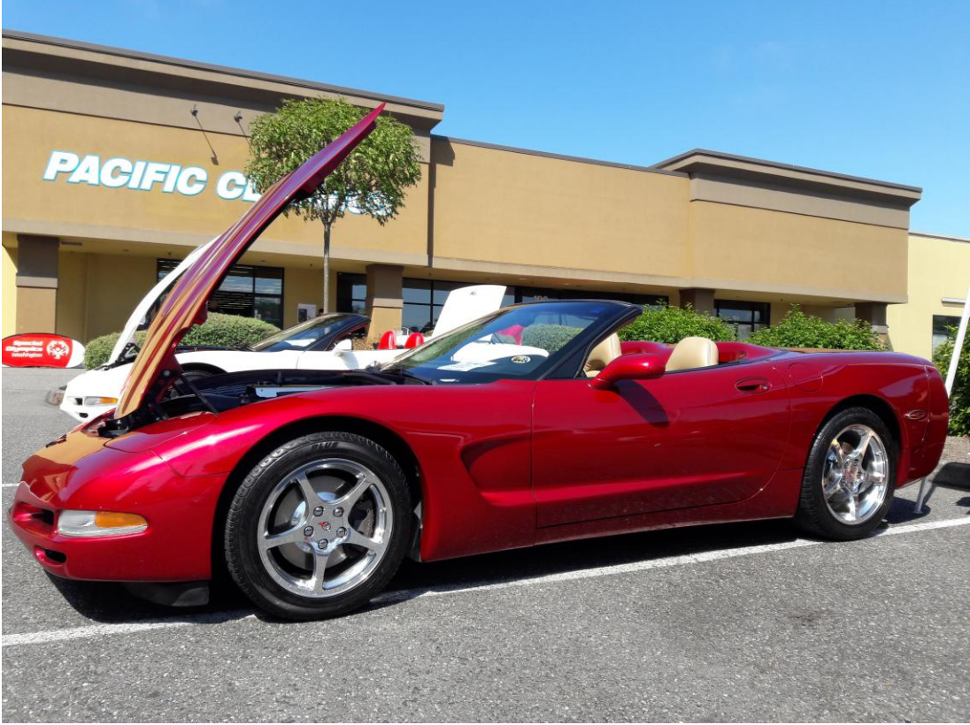
Doug & Linda's 2002 Convertible